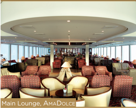
Main Lounge, AMA DOLCE