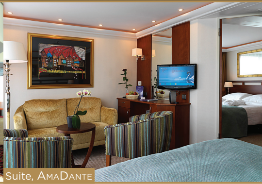
Suite, AMA DANTE