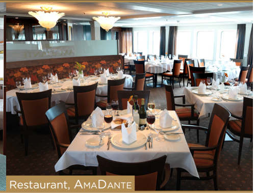
Restaurant, AMA DANTE